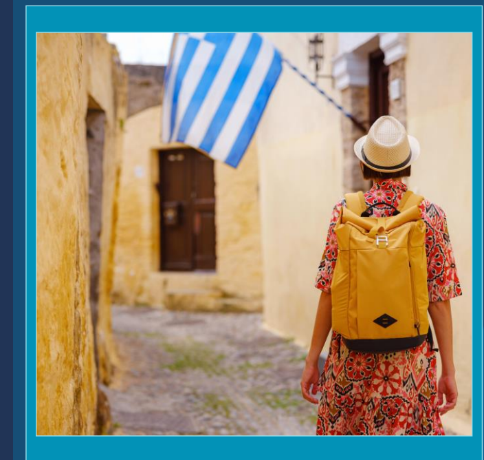
Cultural & Specialized Experiences